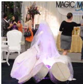
The Unveiled Wedding Event The Wedding Guys®

For the launch of our national tour we were challenged to destroy the mold of traditional bridal tradeshow marketing. With cutting edge graphic design we promoted our ultimate wedding planning experience to Dallas Brides.